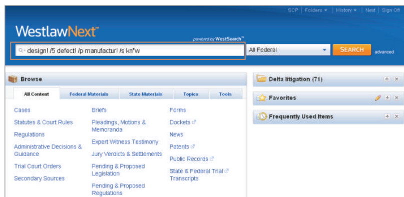
Figure 1. Terms and Connectors search at the home page

For research assistance 24 hours a day, seven days a week, call the West Reference Attorneys at 1-800-850-WEST (1-800-850-9378).